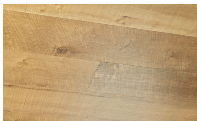
ESQUIRE MAPLE COESQ7M5MM-18