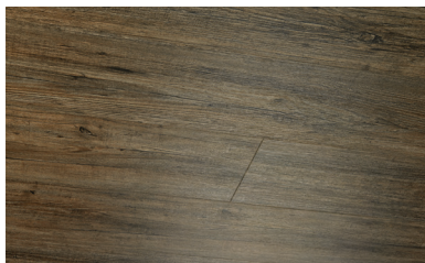
CHEVALIER PINE COCHE7P5MM-18