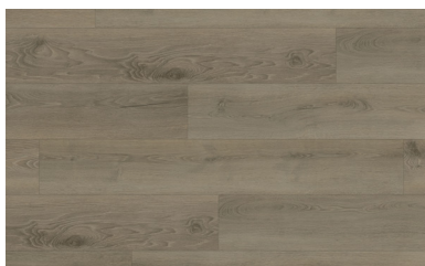
FALCONER OAK COFAL9O5MM-19