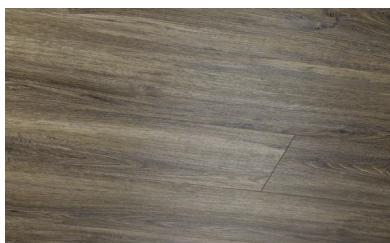
IMPERIAL OAK COIMP7O5MM-18