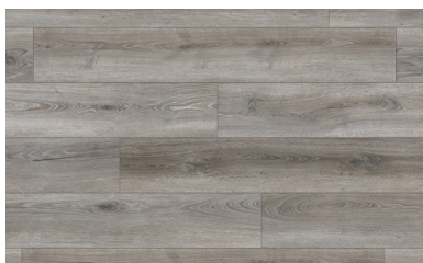
ROYAL OAK COROY9O5MM-19