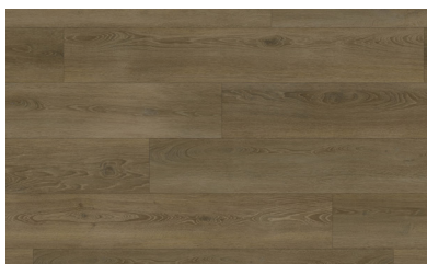
ROHAN OAK COROH9O5MM-19