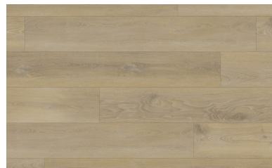
CAMARILLA OAK COCAM9O5MM-19