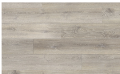
KINGSGUARD OAK COKIN9O5MM-19