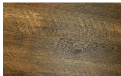
MONARCH HICKORY COMON7H5MM-18