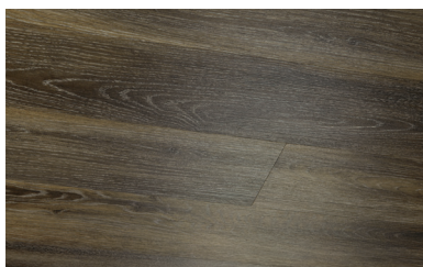
PALADIN OAK COPAL7O5MM-18