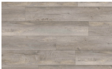
STEWARD OAK COSTE9O5MM-19