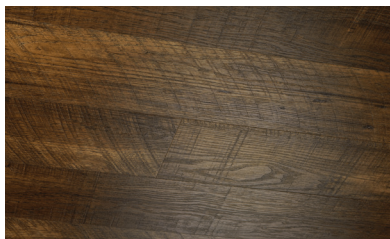
BARONESS HICKORY COBAR7H5MM-18