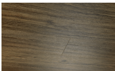
SOVEREIGN OAK COSOV7O5MM-18