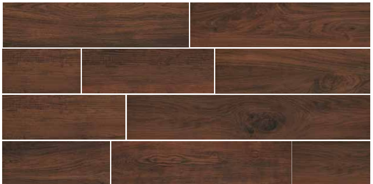
28395 8x36 Mahogany