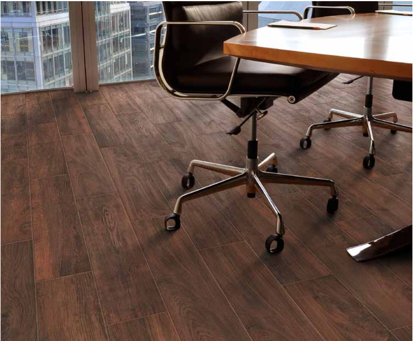
Shown: 28395 8x36 Mahogany