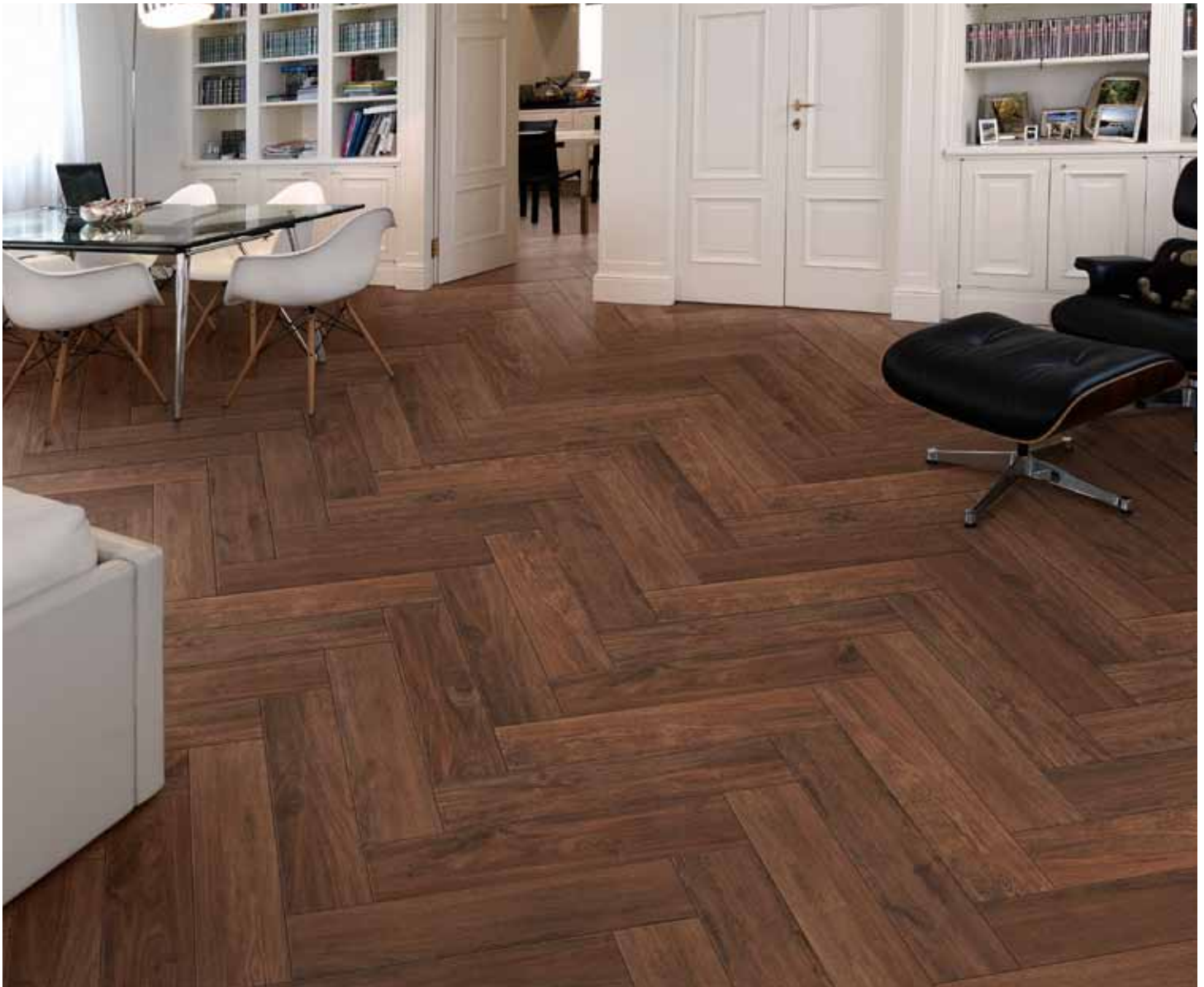
Shown: 28325 8x36 Burl