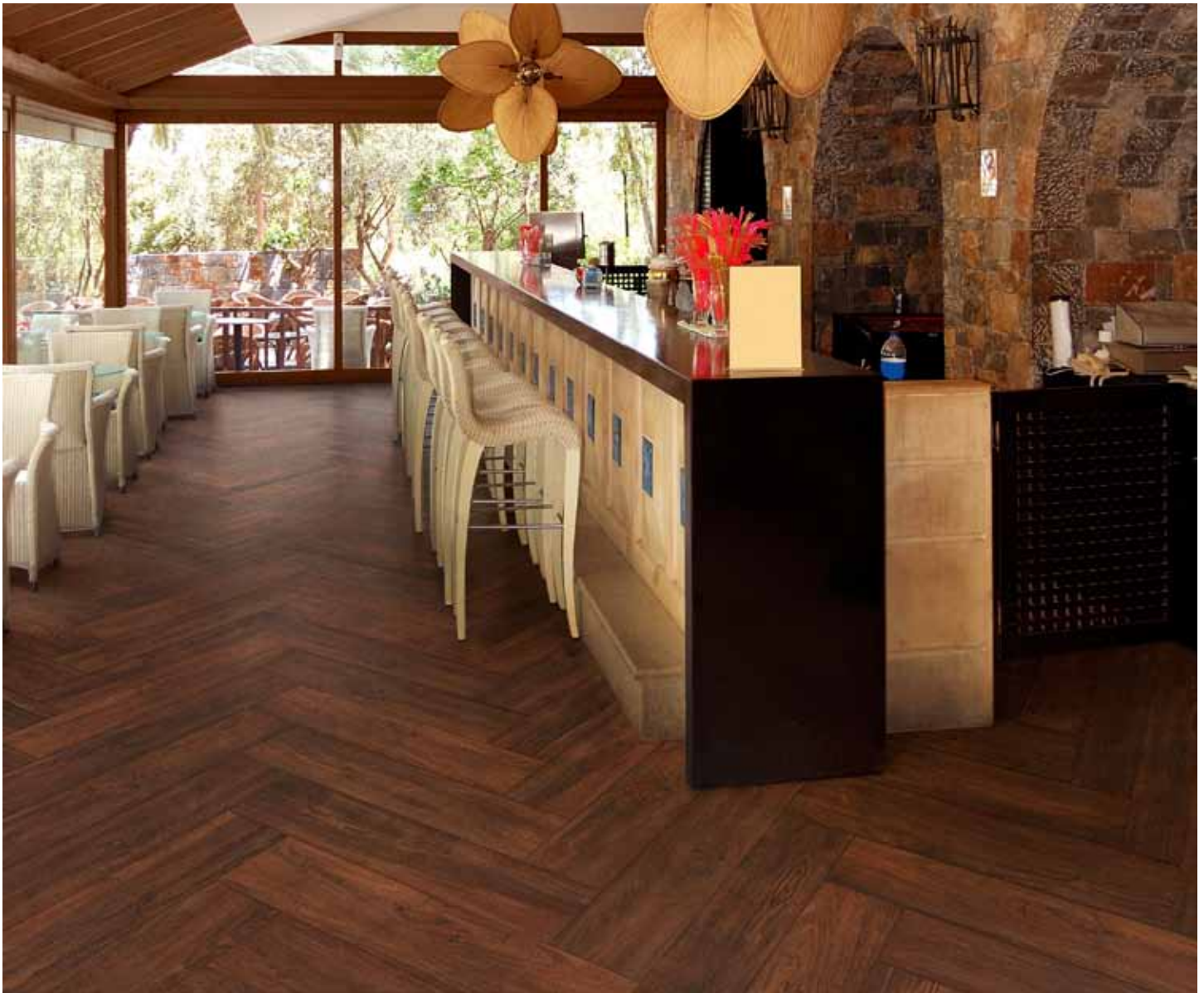
Shown: 28378 8x36 Cherry