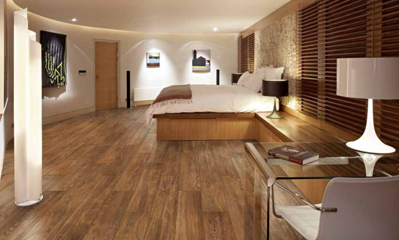
Shown: 28327 8x36 Chestnut