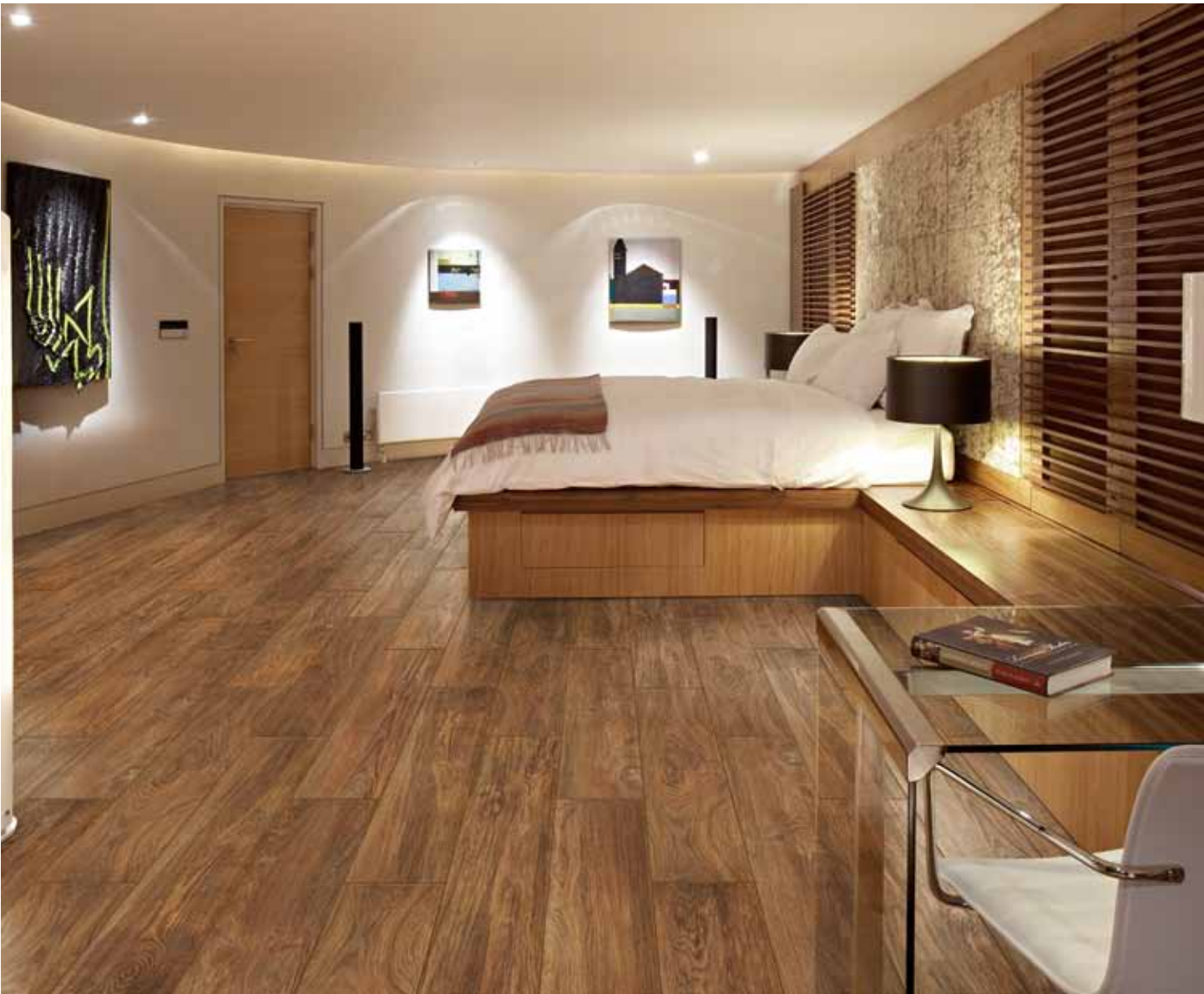
Shown: 28327 8x36 Chestnut