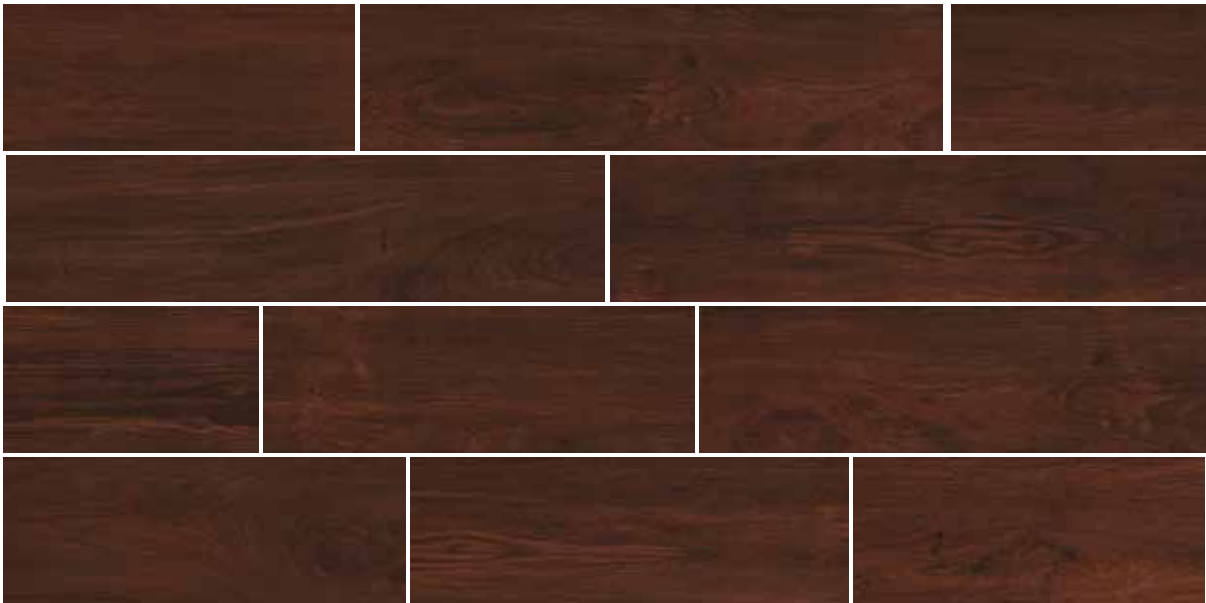
28378 8x36 Cherry