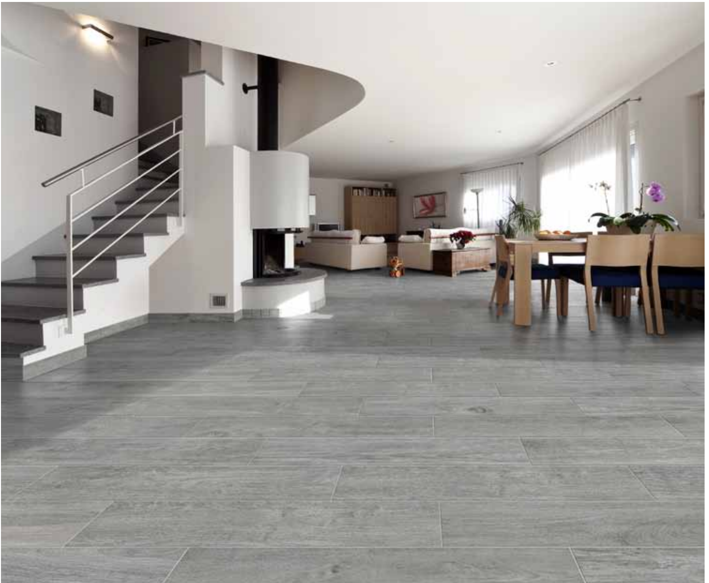
Shown: 28315 8x36 Ash