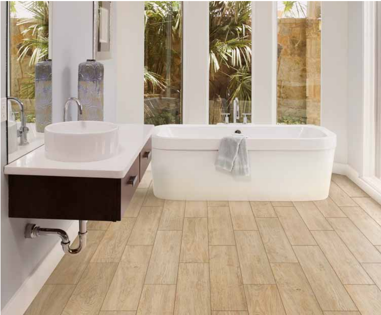
Shown: 28338 8x36 Fir