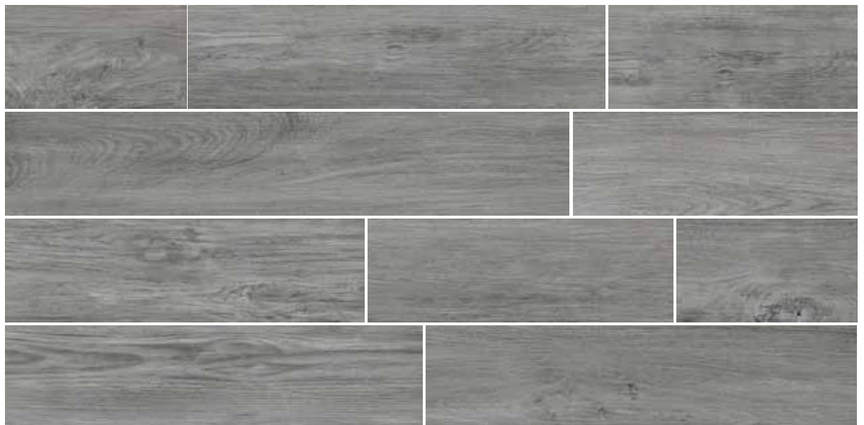
28315 8x36 Ash