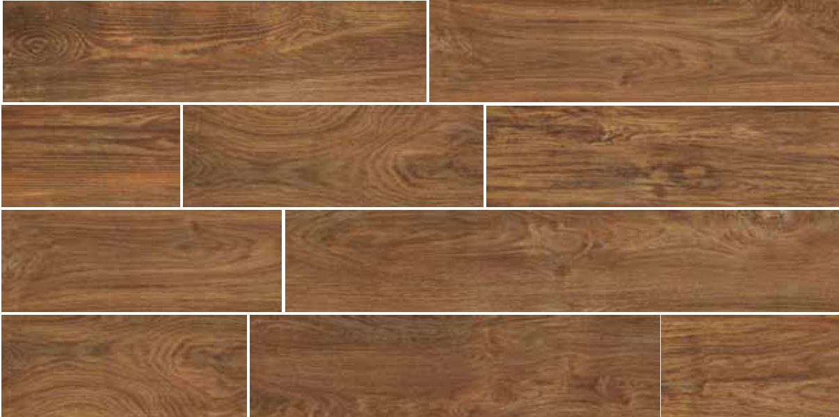
28327 8x36 Chestnut