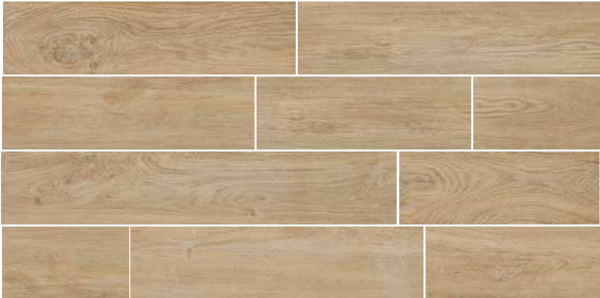
28338 8x36 Fir