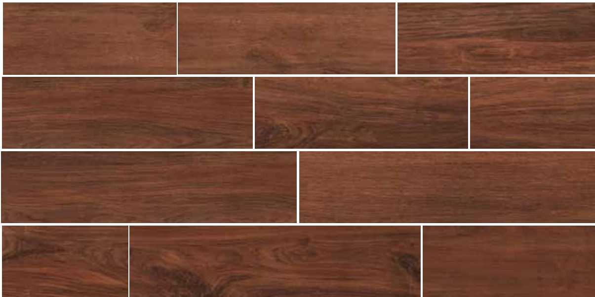
28325 8x36 Burl