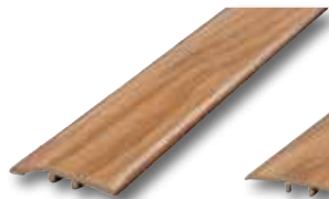
Multi Purpose Reducer (MPR) VSMR