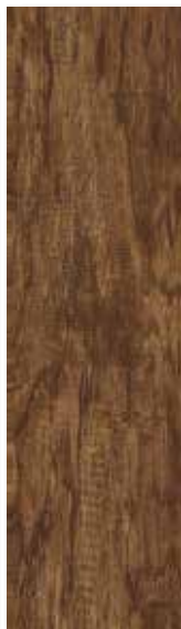
670 Angelina Hickory