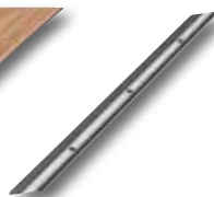
Track Molding (packaged with MPR & T-Molding)