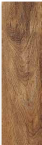
620 Rainforest Teak