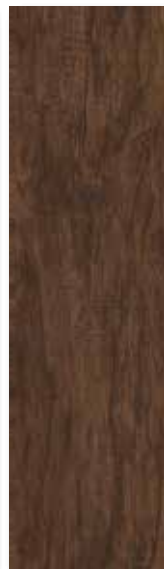
750 Carolina Hickory