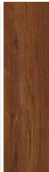
760 Belle Meade