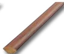
Quarter Round VSQTR