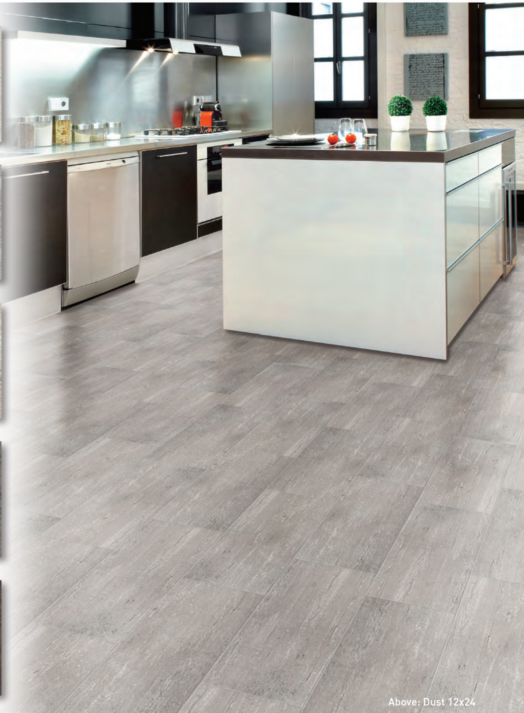
Above: Dust 12x24