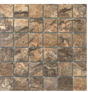
Safari Green Mosaic

Application: Floor Visual: Slate Sizes: 20x20, 13x20*, 13x13, 2x2 Mosaic 13x13 Sheet